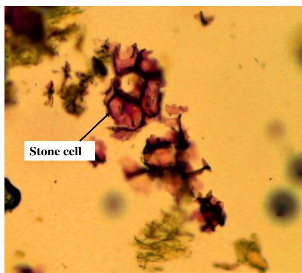
Figure 3. Powdered microscopy of stem bark of M. hortensis showing stone cells (brachysclereids) stained reddish-pink with phloroglucinol in concentrated hydrochloric acid