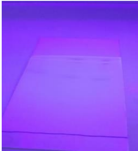
Figure 4. Normal Saline Treated Sample