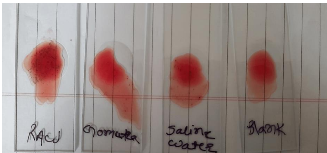
After 10 minutes