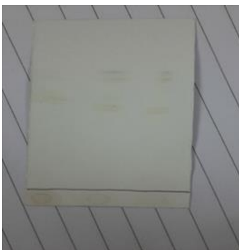
Figure 3. Cow's Urine Treated Sample