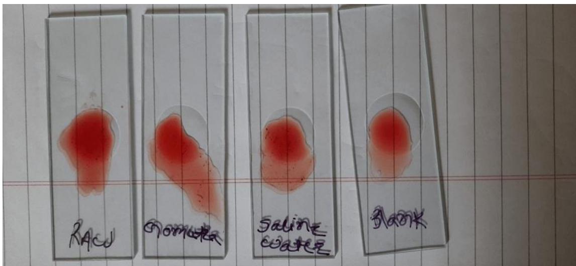
At the time of spotting